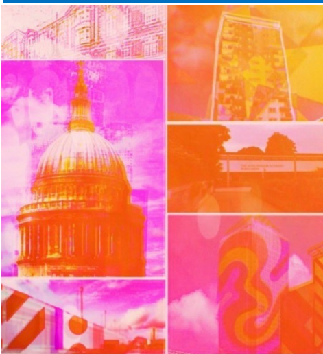
The Hurlingham Academy Summer Art Exhibition