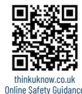
thinkuknow.co.uk Online Safety Guidance

Seek advice on keeping them safe online via thinkyouknow.co.uk and talk to your child about online safety.