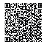
More Online Learning Resources