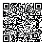
KS1 & 2 National Curriculum